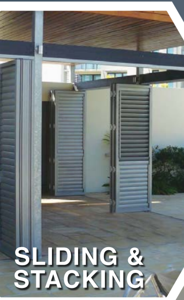
SLIDING & STACKING